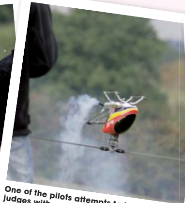
One of the pilots attempts to impress the judges with some close-up 3D action